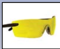
Black Frame/Amber AF Lens #3023027