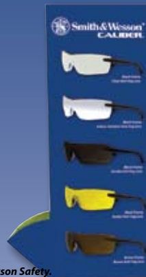
Caliber Gravity Feed, Side View