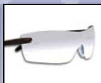
Black Frame/In/Outdoor AF Lens #3023026