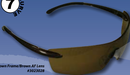
Brown Frame/Brown AF Lens #3023028