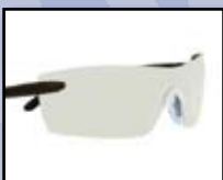
Black Frame/Clear AF Lens #3023024

Smith & Wesson Corp used under license by Jackson Safety.