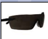
Black Frame/Smoke AF Lens #3023025