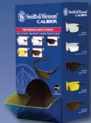
*Must purchase a standard pack of 12 to receive gravity feed.