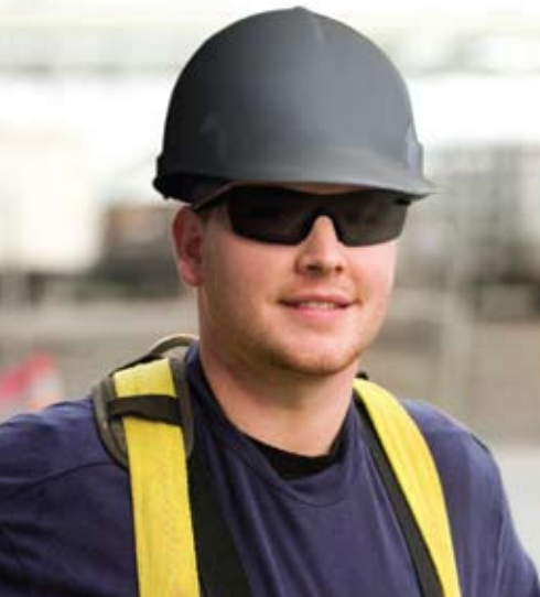
Shown in image #3023025 Caliber, Smoke AF Lens #3001994 SC-6 Hard Hat, Gray