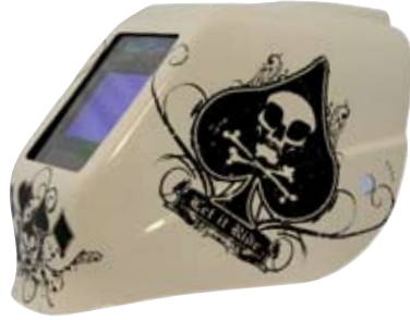
New Ace of Spades