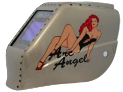
New Arc Angel