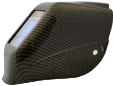
New Carbon Fiber