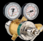
Two Stage Regulators