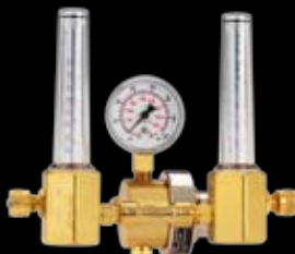
Dual Flowmeter Regulator