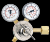
Pressure Regulators & Flowgauges

Regulator safety devices such as Flashback Arrestors and Reverse Flow Check Valves are also available for use with to Series 30 Regulators.