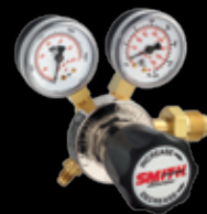
Purge/Leak Test Regulator